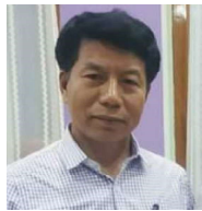
By: N. Munal Meitei

Climate in 2022 was just like the left foot in the ice and the right in a boiling water and taking the average. Global warming is undoubtedly increasing to extremes - heat waves, droughts and floods, sometimes bewildering the whole world.