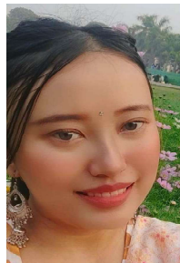
By - Deepika Mayanglam

If we consider on the possible economic losses due to mental health condition as per the World Health Organization (WHO), an estimate of One Trillion USD worldwide during 2012-2030. As per the reports of the National Mental Health survey (NMHS) it has been found that 14% of the population in our country need mental health professional help.